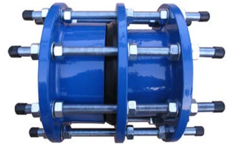
Epoxy coated body according to EN 14901 RAL 5015, 250 µm thickness (WRAS QUALITY)

Range : from DN50 to DN2000. Connection : PN10/16 (DN50-DN150) and PN16 beyond GEOMET 500® steel tie rods and nuts. Epoxy coating. Adjustment of +/-25 mm.